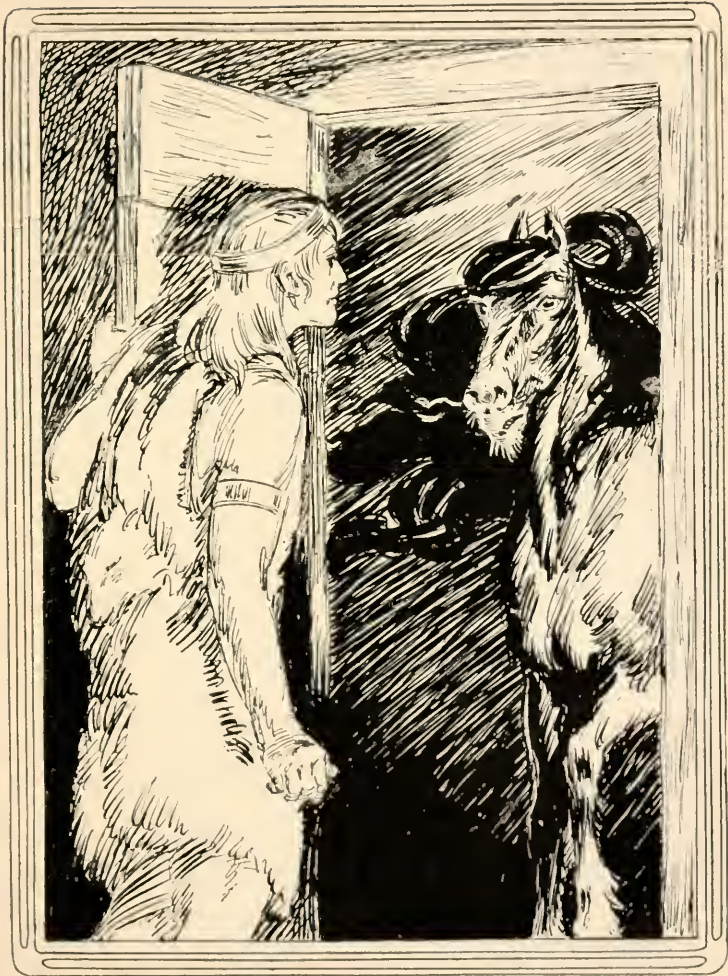
"Fergus knew it was the Pooka, the wild horse of the mountains" . . . . . Page 81